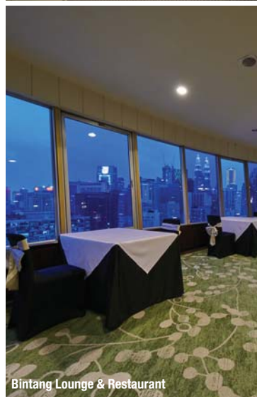
Bintang Lounge & Restaurant