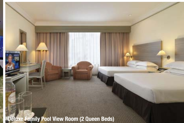
Deluxe Family Pool View Room (2 Queen Beds)