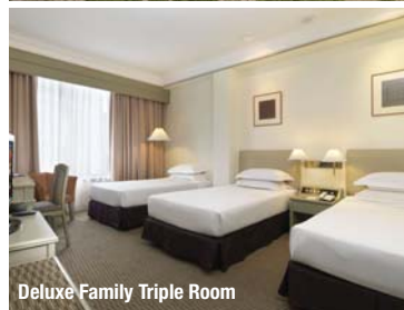
Deluxe Family Triple Room