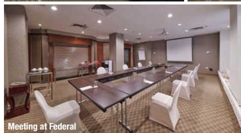
Meeting at Federal